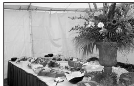
A catered reception followed the 2005 Moss Society event.