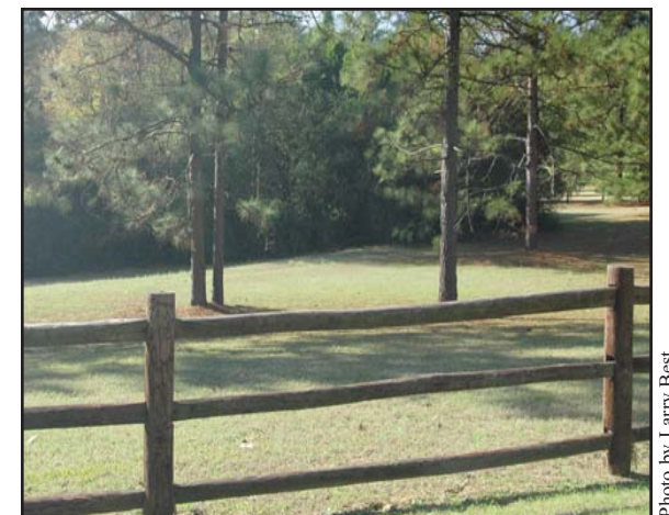
THE MEACHAM CONSERVATION EASEMENT: 12.20 ACRES OF PRESERVED LAND.

Our community is created by a composite landscape made up of many properties. At a certain scale or size they create the rural landscape. If in time the size of these properties continue to become smaller, at some point the rural character is lost and becomes more suburban in character. A conservation easement is the perfect vehicle to protect the rural character while also allowing the present owners to enjoy their chosen lifestyle.