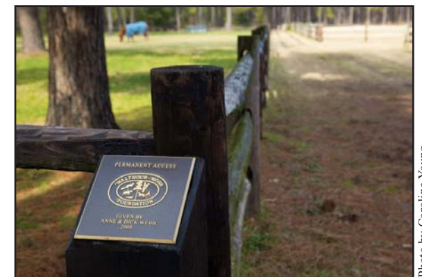
EACH EASEMENT AND ACCESS IS MARKED BY A PLAQUE THAT LISTS THE DONOR AND DATE OF THE GIFT