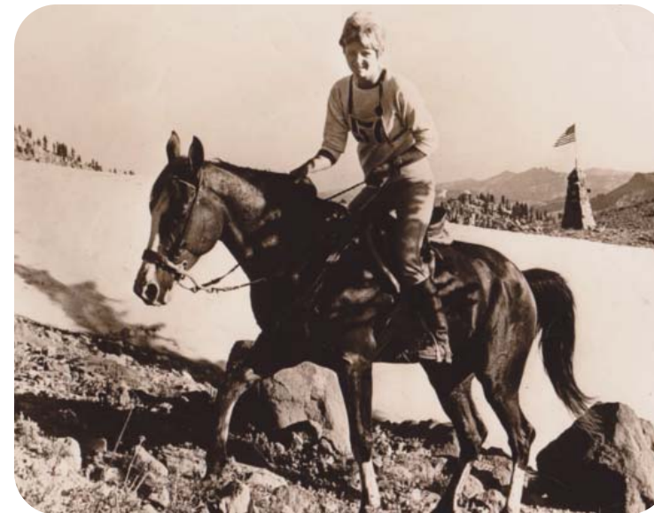
TEVIS CUP 100 MILE RACE, HALFWAY POINT, 1969

often awarded belt buckles and Angela proudly had several to call her own.